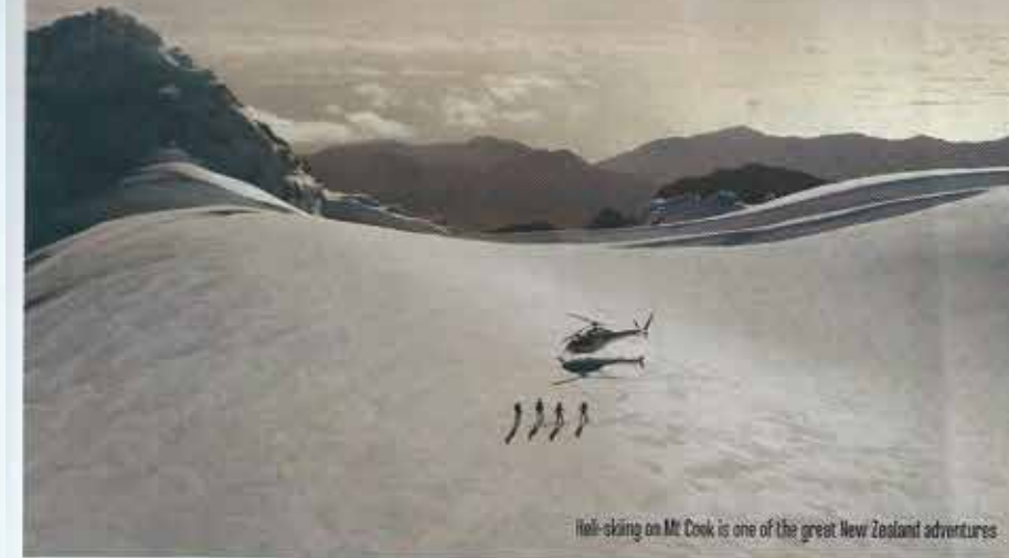
Heli-skiing on Mt Cook is one of the great New Zealand adventures

Many mountain resorts have turned their focus to families, which has resulted in an outbreak of quality ski schools, crèches for children and alternative snow activities for those who don't ski, such as tubing and