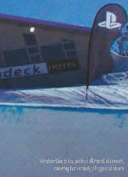
Perisher Blue is the perfect all-round ski resort, catering for virtually all types of skiers