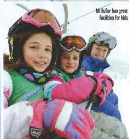
Mt Buller has great facilities for kids