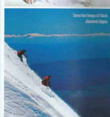
Perisher Blue is perfect for families

tobogganing. Look for package holidays that offer deals where kids ski, and sometimes get to stay and eat for free.