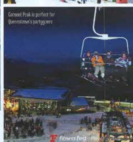
Coronet Peak is perfect for Queenstown's partygoers

Whether you are a snow novice or expert, looking for a family holiday, or want to strut your stuff, there's a resort to suit your needs. Depending on which side of the Australian Alps you live usually determines what resorts you're most likely to visit. But if distance is no barrier, there is a huge range of diverse mountain terrain just waiting to be explored locally and in New Zealand.