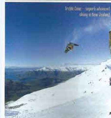
Treble Cone – superb advanced skiing in New Zealand