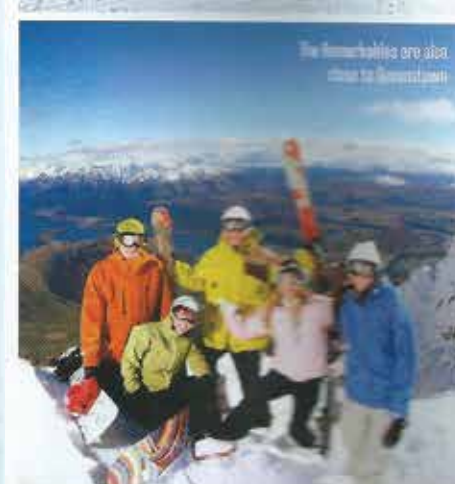
The Remarkables are also close to Queenstown