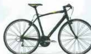
Merida Speeder T1 Silk