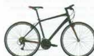
Avanti Giro F2