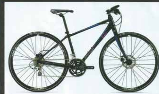
Giant Liv Thrive 1 Disc in Black

MERIDA has come up with the Speeder range of fitness bikes to suit a range of budgets, with the T1 series being a popular mid-range choice. What's handy is the frame measuring system that Merida employs if you go to a bike shop specialising in their range. A few quick measurements and they can match you up with the right frame size in a jiffy. Prices start at $529 for the Speeder S1 up to $849 for the Speeder T1, and $1,449 for the Speeder T5. merida.com.au