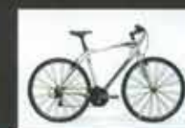
Merida Speeder T1 Juliet