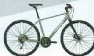
Giant Cross City 0 Disc