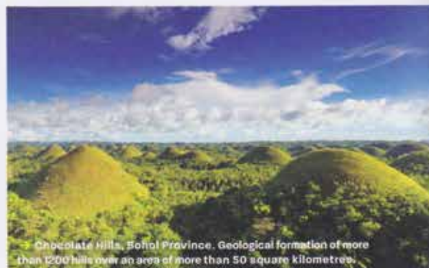
Chocolate Hills, Bohol Province. Geological formation of more than 1200 hills over an area of more than 50 square kilometres.