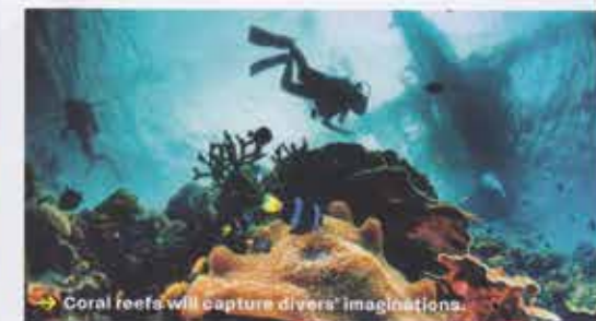
→ Coral reefs will capture divers' imaginations.

The cute bright-eyed Tarsier looks like a friendly gremlin and is small enough to sit easily in the palm of your hand. Endemic to the island of Bohol, they're a protected species and a visit to the Philippine Tarsier and Wildlife Sanctuary will give you an up close and personal experience with these critters in their natural habitat.