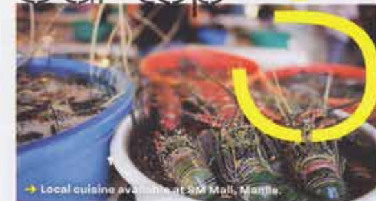
→ Local cuisine available at SM Mall, Manila.