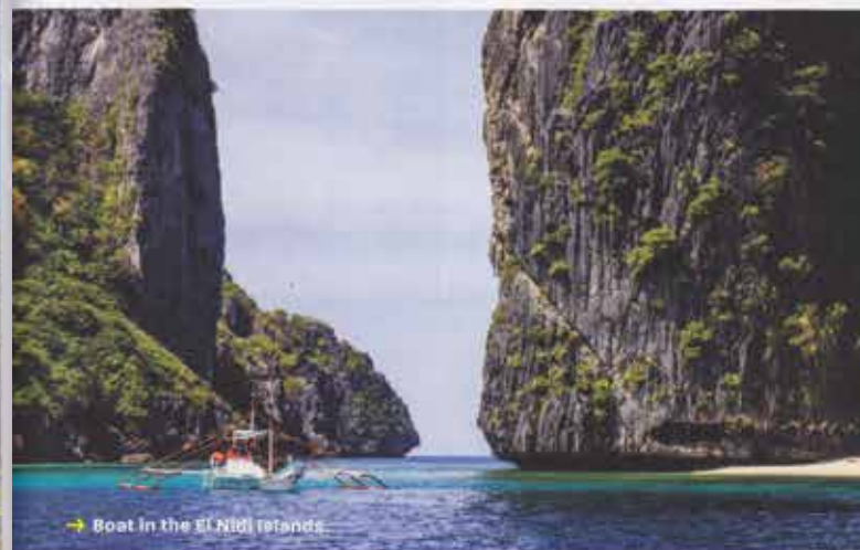
→ Boat in the El Nido Islands.