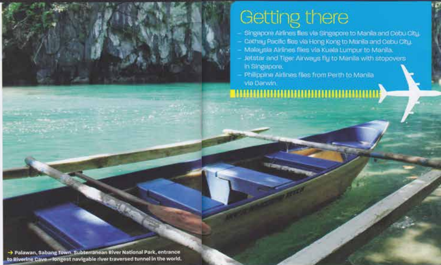
→ Palawan, Sabang Town, Subterranean River National Park, entrance to Riverine Cave—longest navigable river traversed tunnel in the world.

To swim in the cleanest lake in the country, head to Coron on Busuanga Island. It's hard to fathom that the waters in Kayangan Lake can be any clearer than the crystalline depths of the ocean where you leave the Bangka (boat) that you arrive on. Put on snorkelling gear and marvel at the endless visibility. For solitude and long white sandy beaches, Banana Island has some amazing snorkelling just a few metres from shore with plenty of Pacific giant clams to keep you enthralled. ●●●