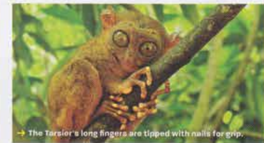
→ The Tarsier's long fingers are tipped with nails for grip.

Filipinos simply love to shop! No wonder Manila has become one of the best destinations in Asia for shoppers. Whether you're looking for local handicrafts or a whole new wardrobe, visit any mega-mall in the big cities such as Manila and Cebu City and you'll be hard pressed not to find something to take home. Like any Asian city, all budgets are catered for, from the inexpensive street markets and bazaars to the gigantic SM Mall of Asia, touted as one of the biggest malls in the world.